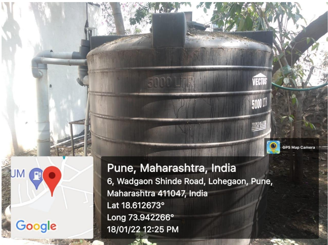
Bio Gas Plant with capacity of 5000 lit