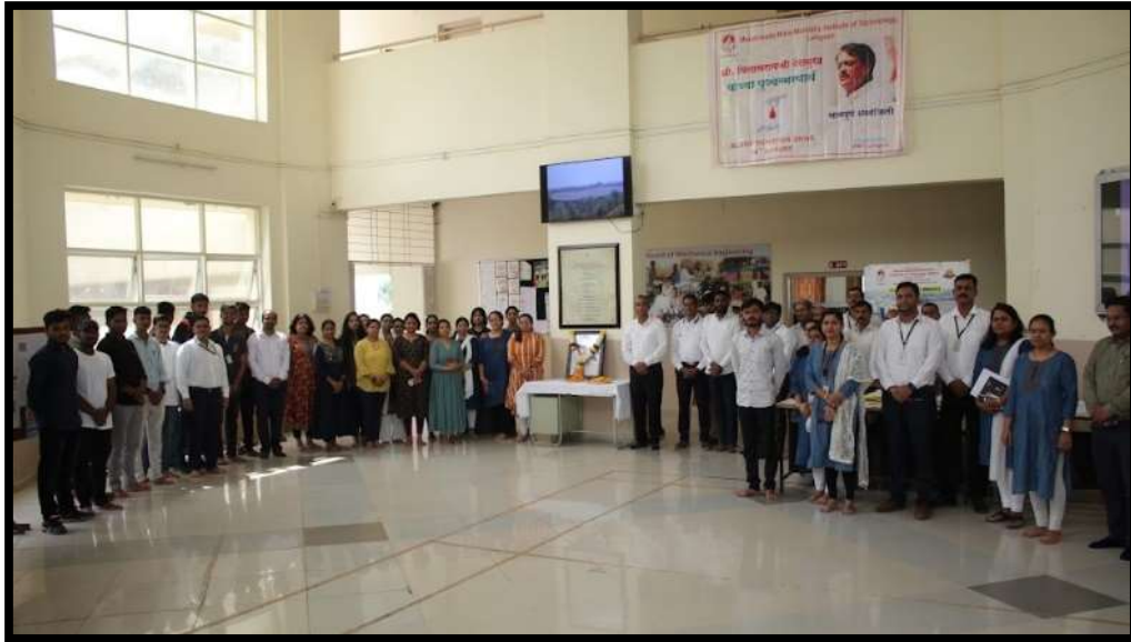
MMIT & MMIED Students and Staff at Tribute Ceremony of Hon. Late Vilasraoji Deshmukh

Everybody observed two minutes of silence in honor of Late Vilasraoji Deshmukh’s soul. At 11:00 am the blood donation camp began in which dozens of students and staff of MMIT & MMIED voluntarily donated blood for this great cause for saving someone’s life.