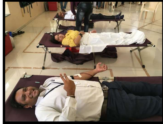
MMIT & MMIED Staff Blood Donation