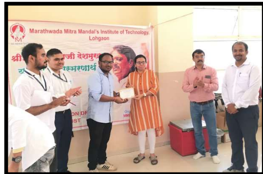
Student Appreciated with Donor Certificate from Gholap Blood Bank Association