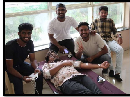
MMIT & MMIED Student Blood Donation