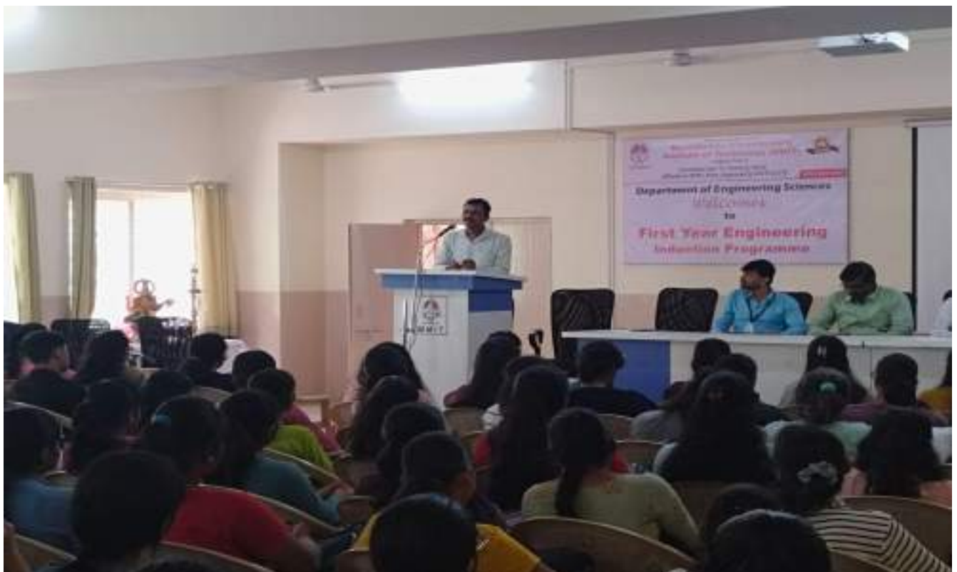
Session by Administrative Officer & team on general rule regulations