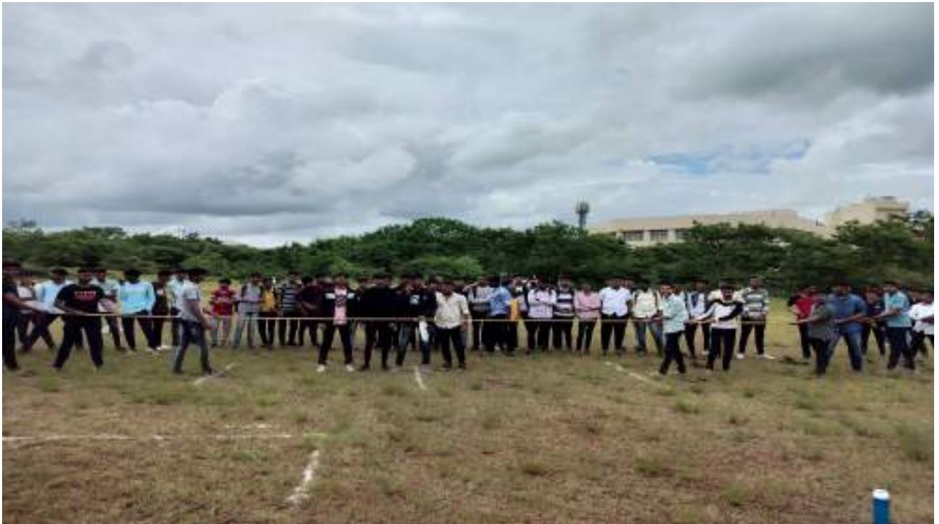
Sports Activities- Tug of war Boys