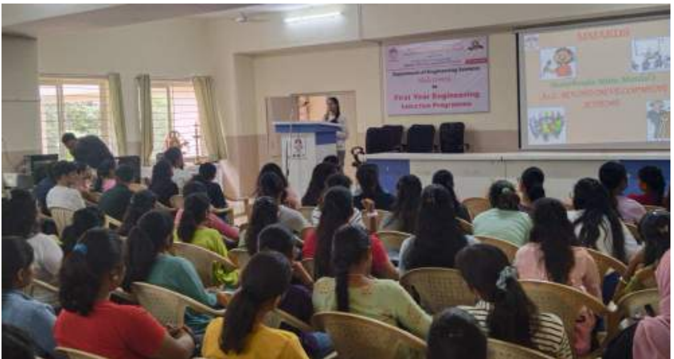
Students active Participation in Induction Activities