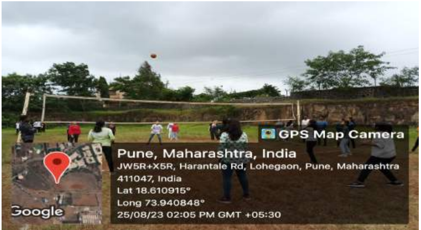
Sports Activities- Girls Volleyball Match-Group-A