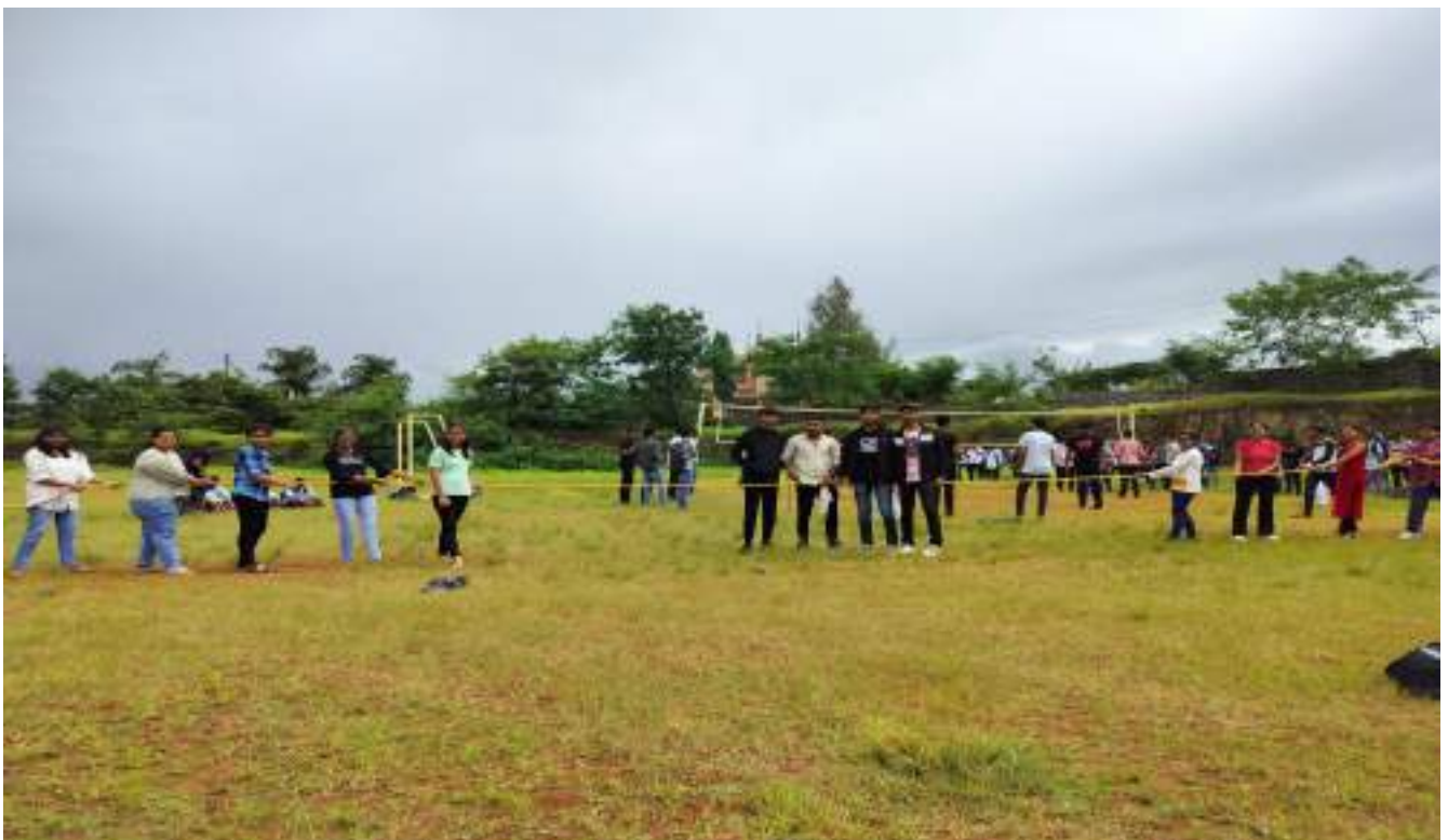
Sports Activities- Tug of war Girls