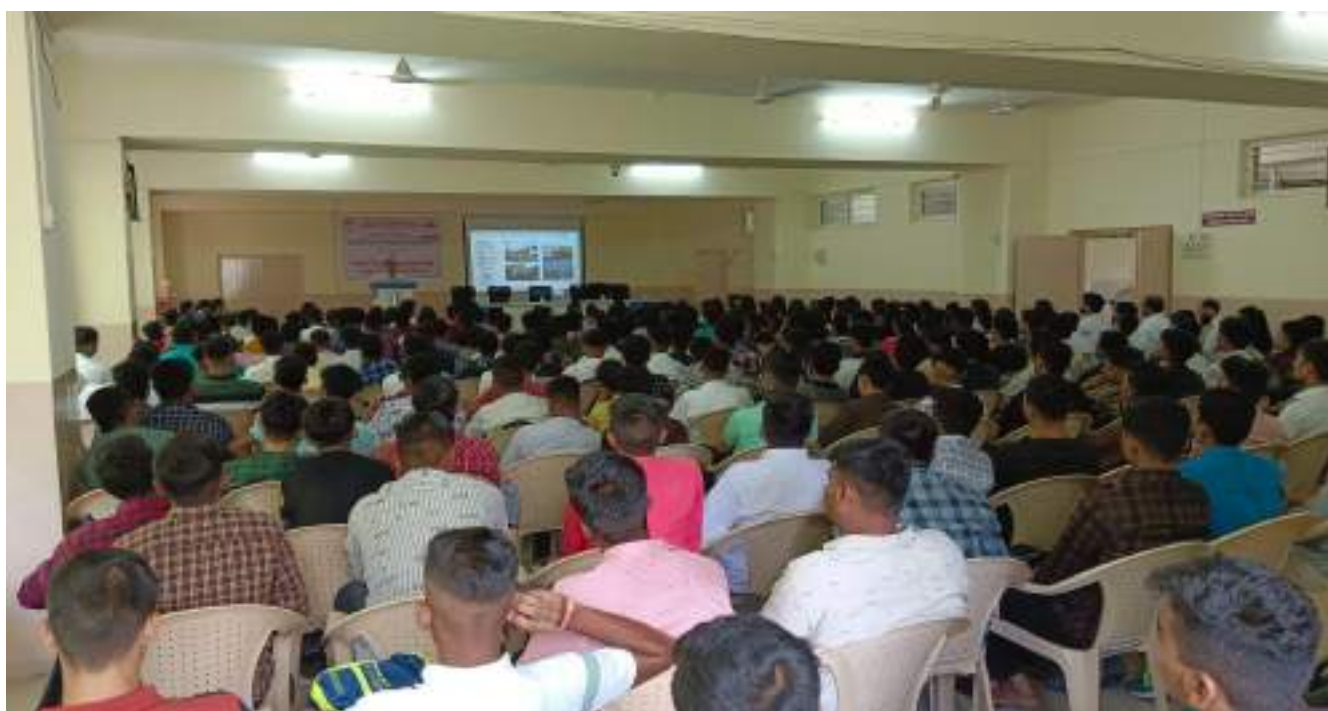
Students at FE Inaugural Function