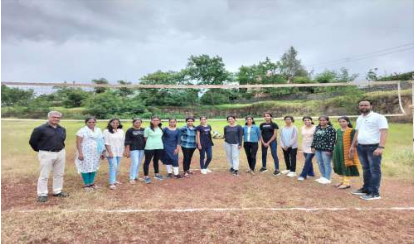
Sports Activities- Girls Volleyball Match-Group-B