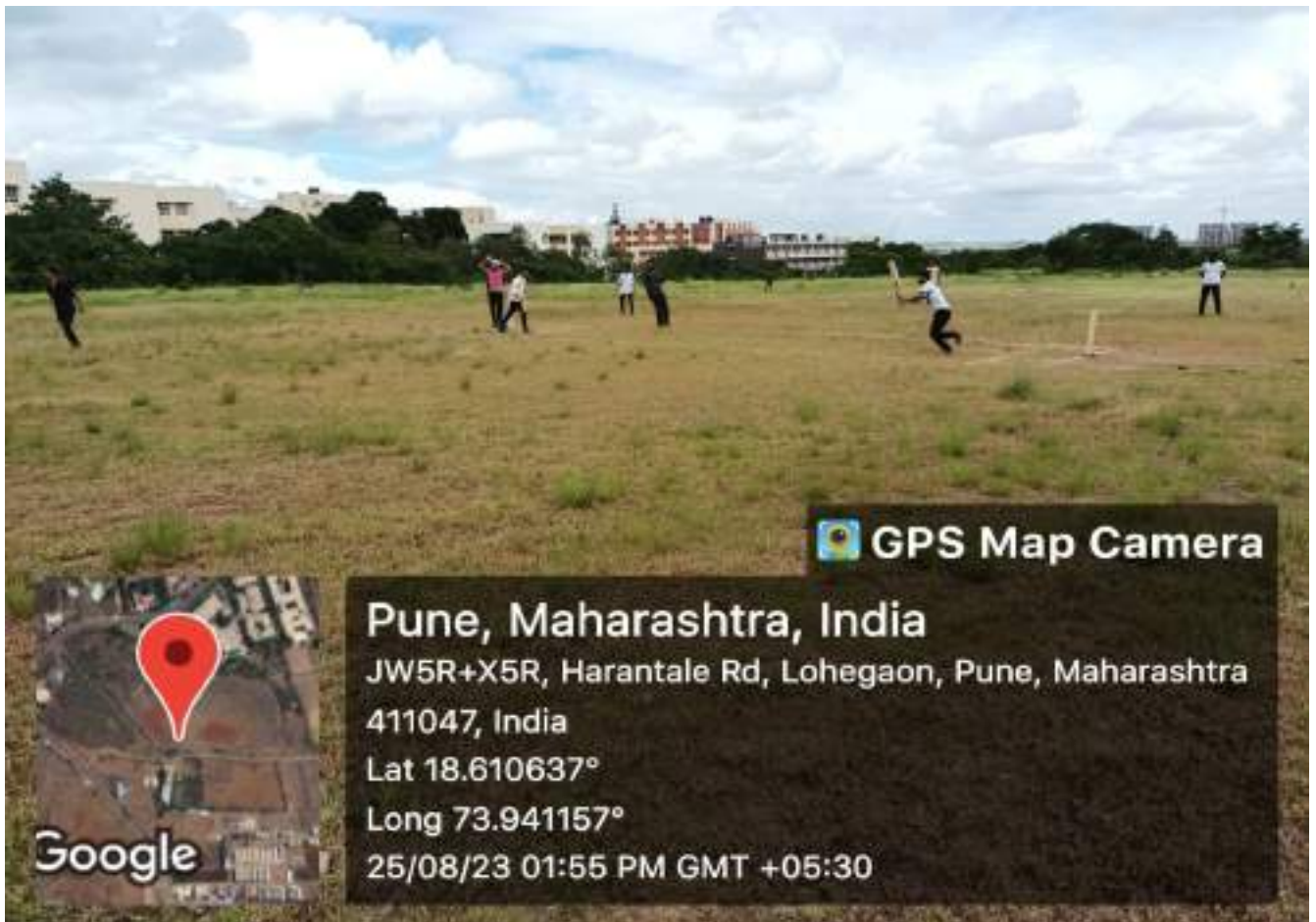
Sports Activities- Boys Cricket Match-Group-A