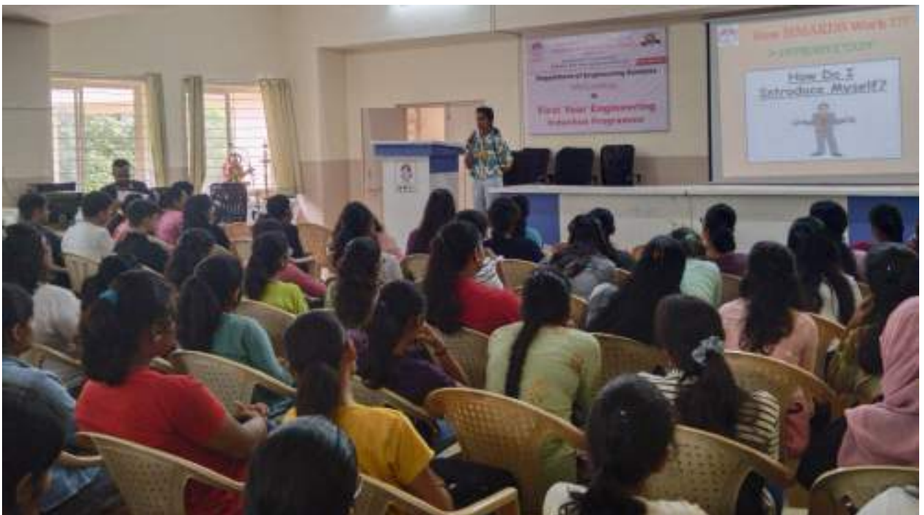
Students active Participation in Induction Activities