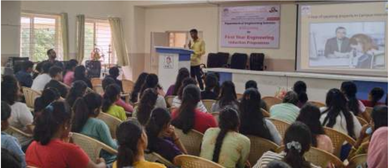
Students active Participation in Induction Activities