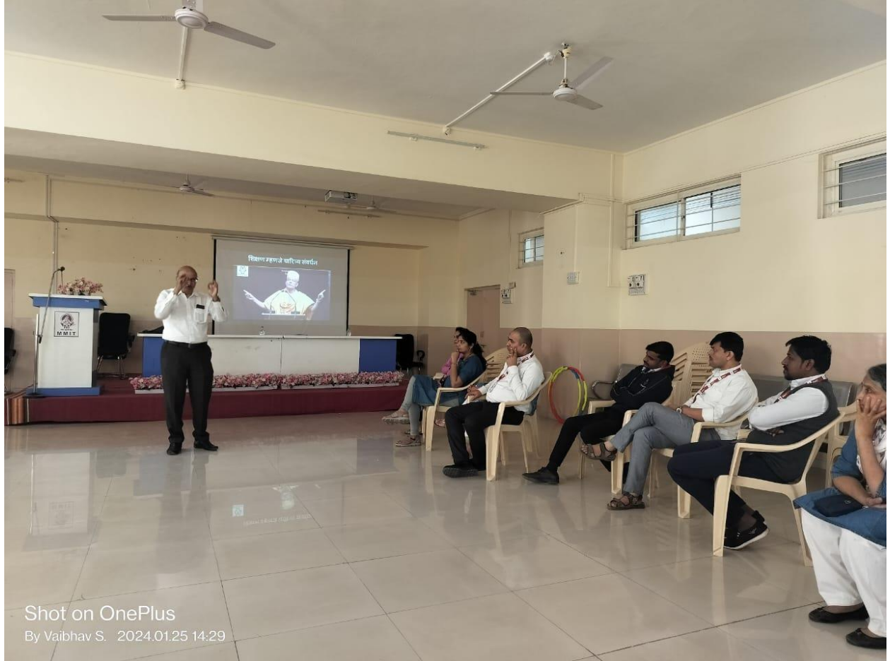
Shot on OnePlus 2024.01.25 14:29