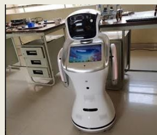
Demonstration of Robots