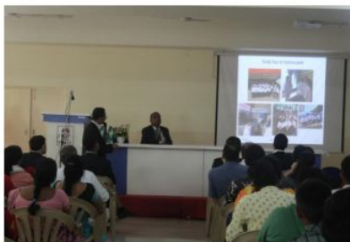
Orientation Program for Students