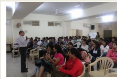
Session by Industry Experts