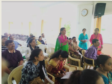
Discussion in PTM