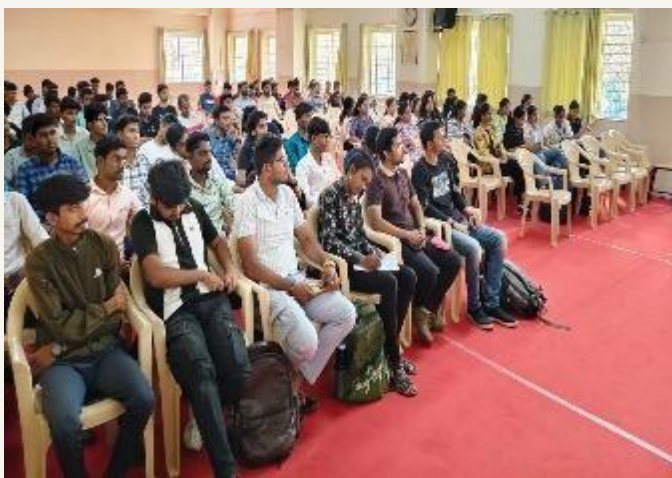
Session of Ancient Indian Architecture