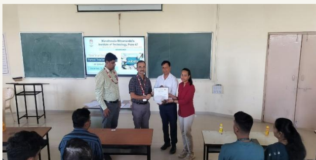
Felicitation of Topper Students