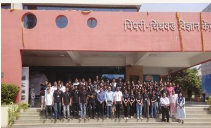
Visit to Science Center