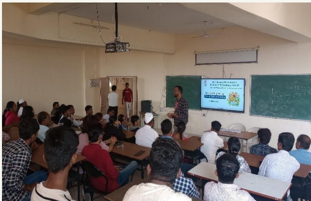
Briefing about Department Activities