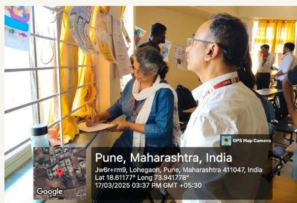
Pi Day Celebration