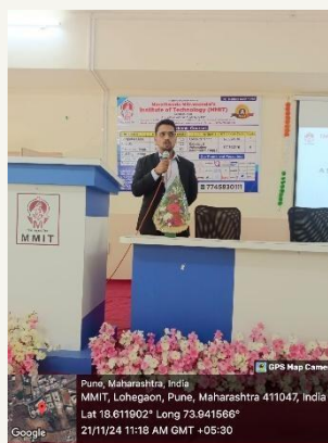
Ideation and Problem-Solving Workshop