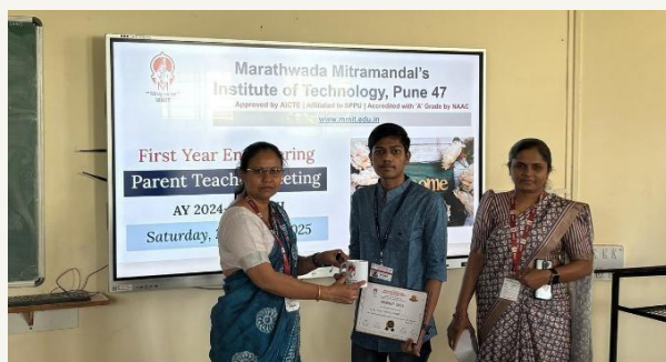
Felicitation of Topper Students