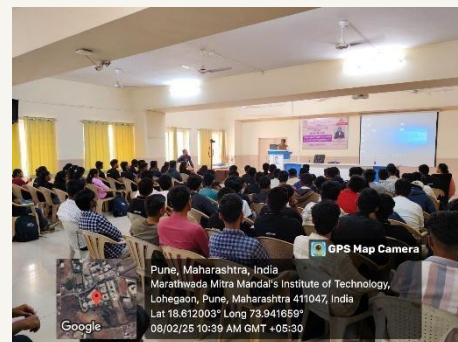
Expert session on Entrepreneurship