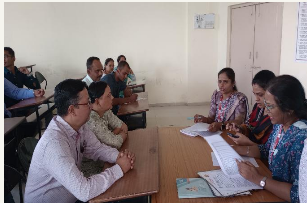
Interaction with Parents