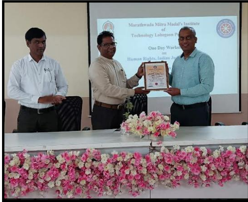
Principal while accepting Certificate for organizing workshop