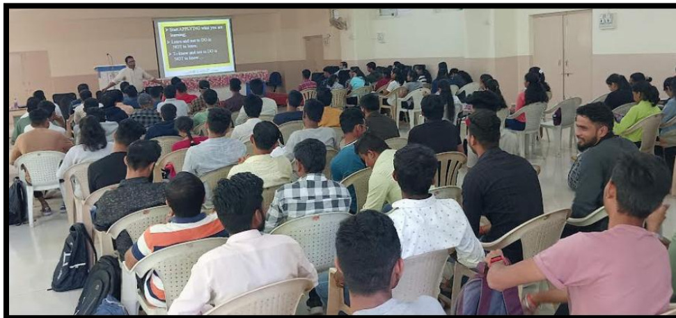
Presence of Participants for workshop