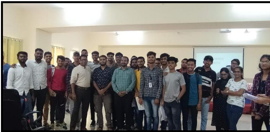
Conclusion of Workshop