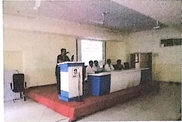
Importance of Yoga