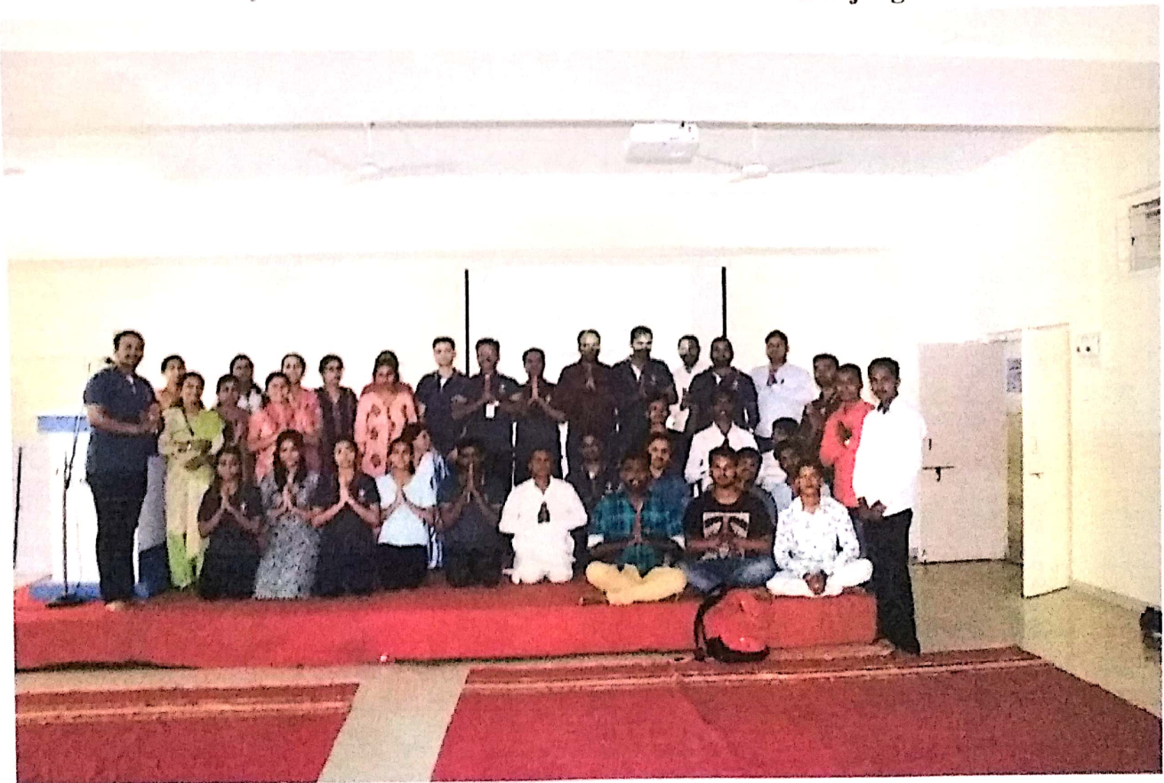
Conclusion of Yoga Session