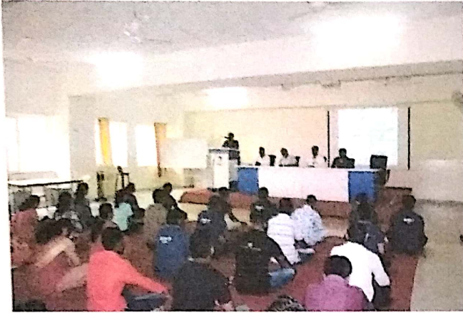
Introduction of Dignitaries